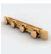
Brass bonding bar for equipotentialization and testing. To be placed inside an inspection pit. Connectors for Ø8-10mm and/or 30x2mm tape.