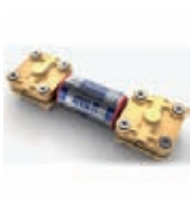
Spark gap for bonding earth terminations. Ip(10/350µs) of 100kA.