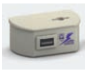
Lightning event counter.