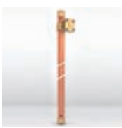
Dynamic electrode APLIROD, vertical, de Ø2500x28 mm.