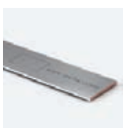
Tinned-copper tape, 30x2mm.