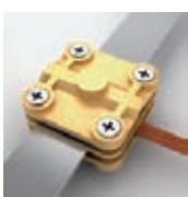
Brass clamp for straight, cross, "T" and parallel connection for Ø8-10mm and/or 30x2mm tape.