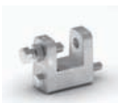
Holdfast to girder.