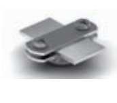
Metallic clip to tape.