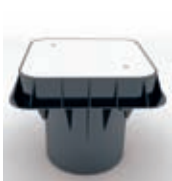
Polypropylene inspection pit, 250x250x250 mm, able to withstand 5000 Kg.